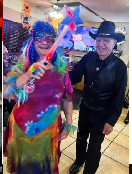
Valle Vista's Ghouls